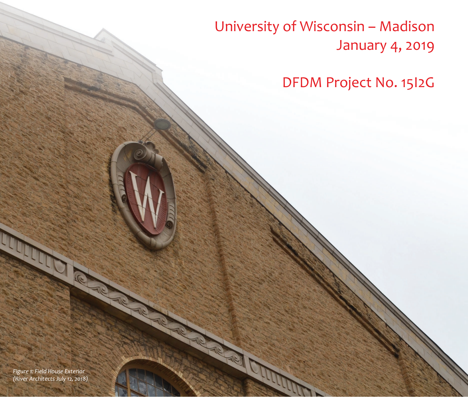
Figure 1: Field House Exterior (River Architects July 12, 2018)